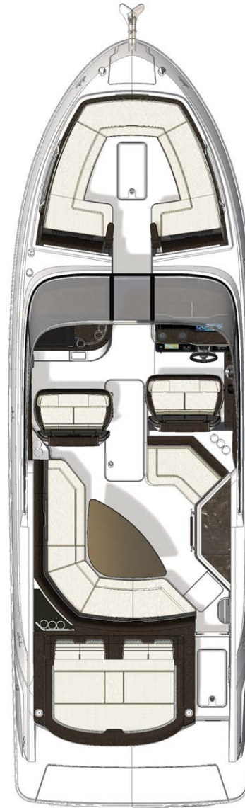
STANDARD SEATING PLAN